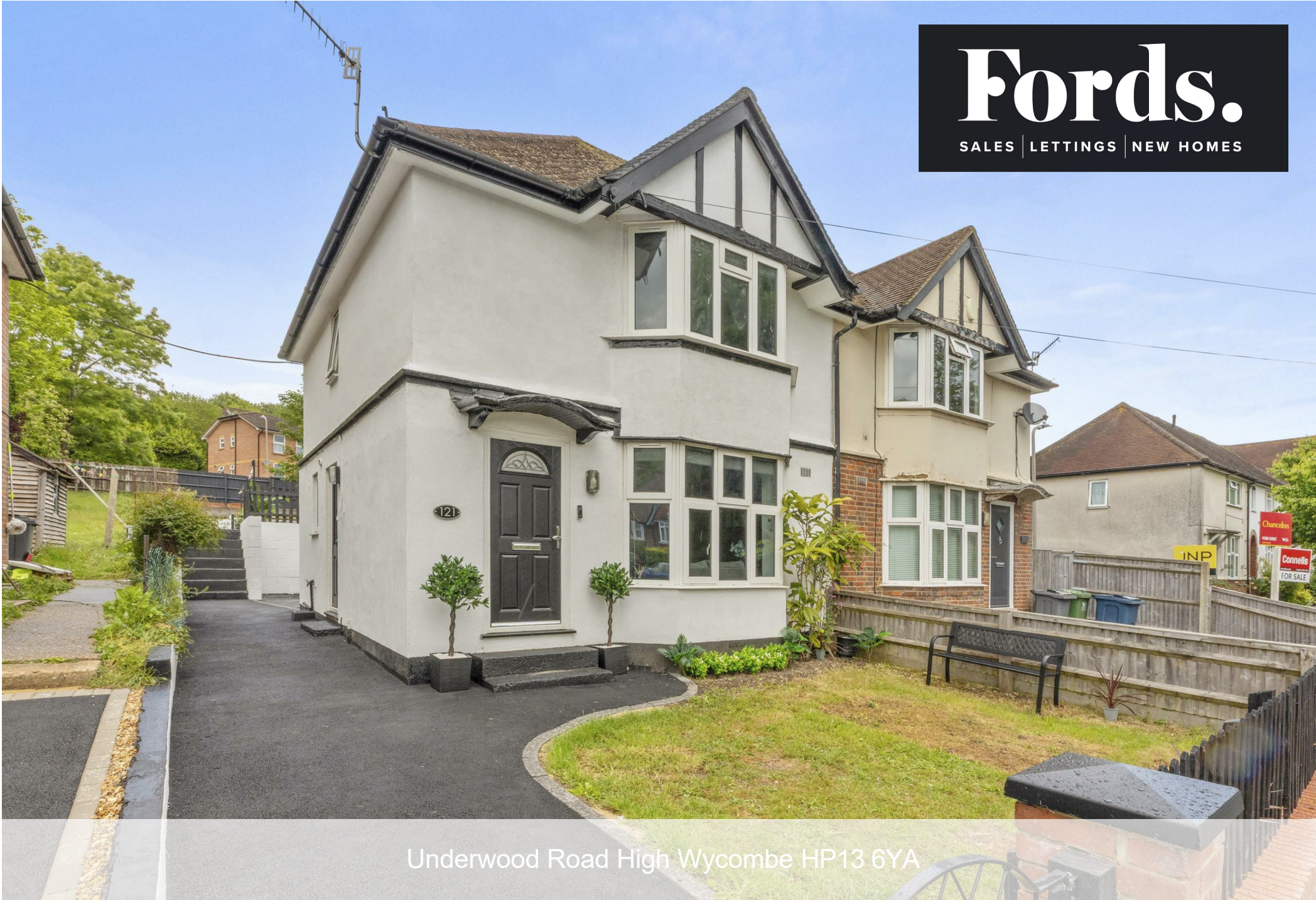
Underwood Road High Wycombe HP13 6YA